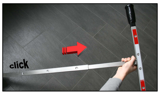
Pull the T-handle until the detents of the inner pipe lock into the bore holes on the outer pipe again with an audible click. Repeat this process until the desired legth is obtained. Reverse order to retract the operating key.